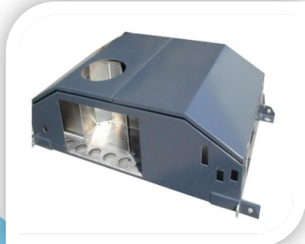
AIR CONDITION EQUIPMENTS FOR ELECTRIC VEHICLES